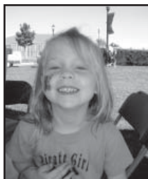
Face painting is fun! Cheeeeeeeese!!!!